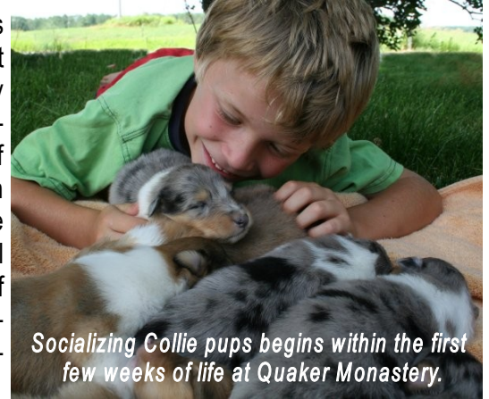
Socializing Collie pups begins within the first few weeks of life at Quaker Monastery.

Puppy socialization involves introducing a pup to different experiences during the early formative time of its physiological development. It is a form of gentle conditioning through which a puppy can learn more about humans in a meaningful way which will become a part of foundational learning and tolerance development for new experiences later on in their lives.