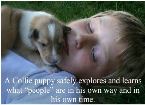
A Collie puppy safely explores and learns what "people" are in his own way and in his own time.